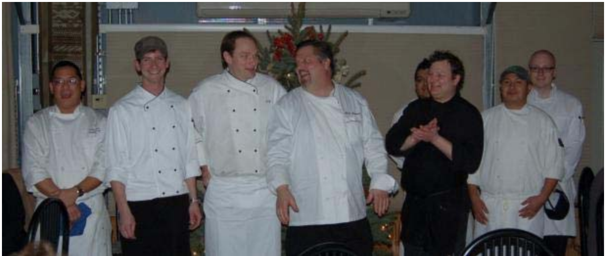
Chefs from the Loudoun Area Chefs Collaborative volunteered their time for the event.