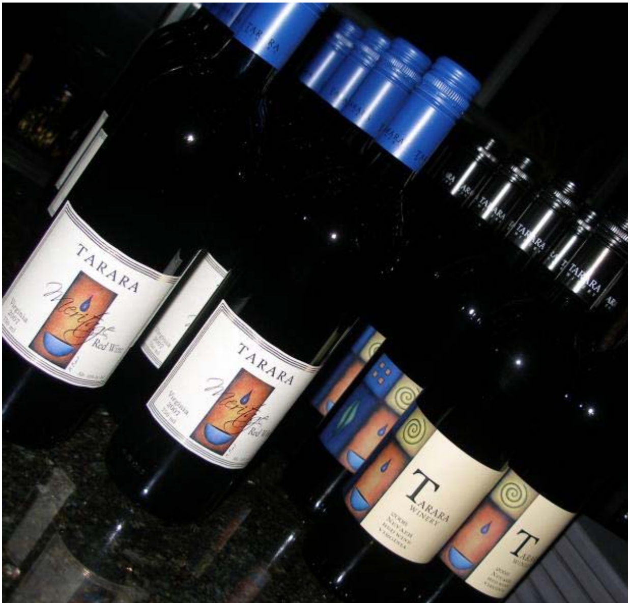
Beverages and wine were provided by Catocin Creek Distillery and Tarara Winery.