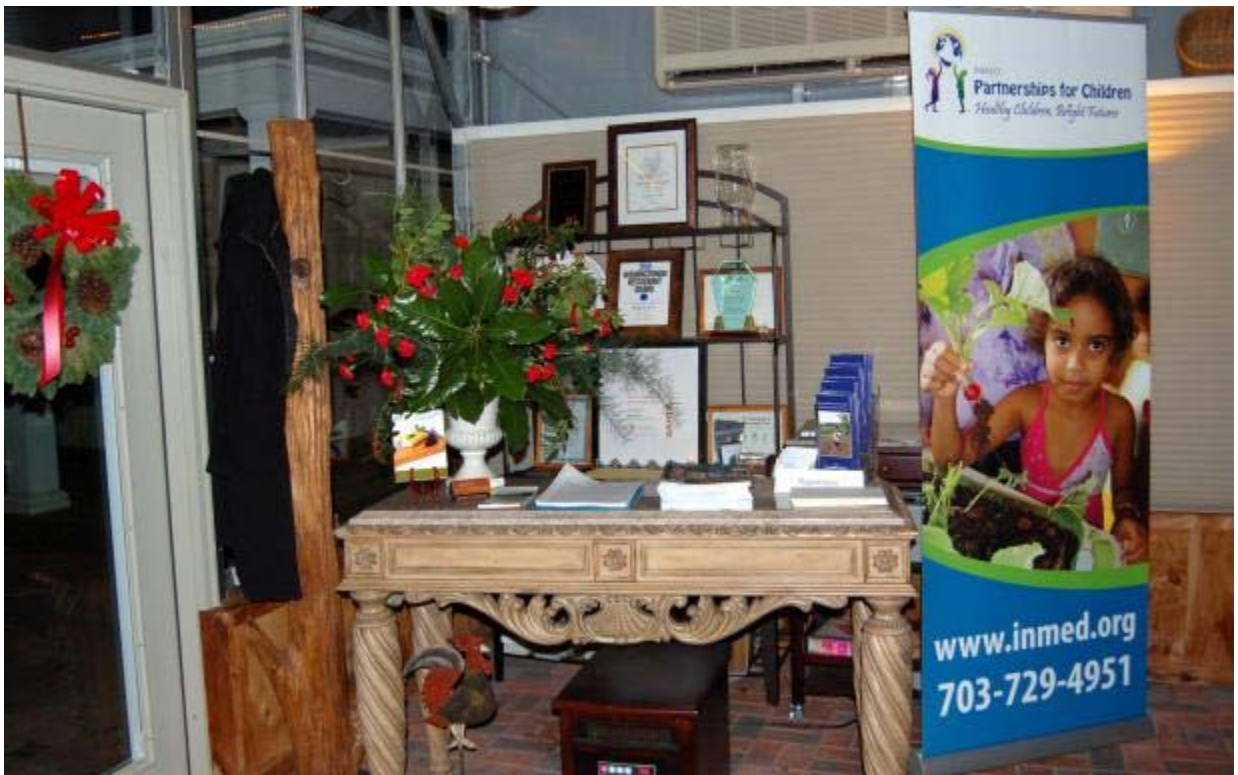
INMED is an international nonprofit development organization based in Ashburn, VA.