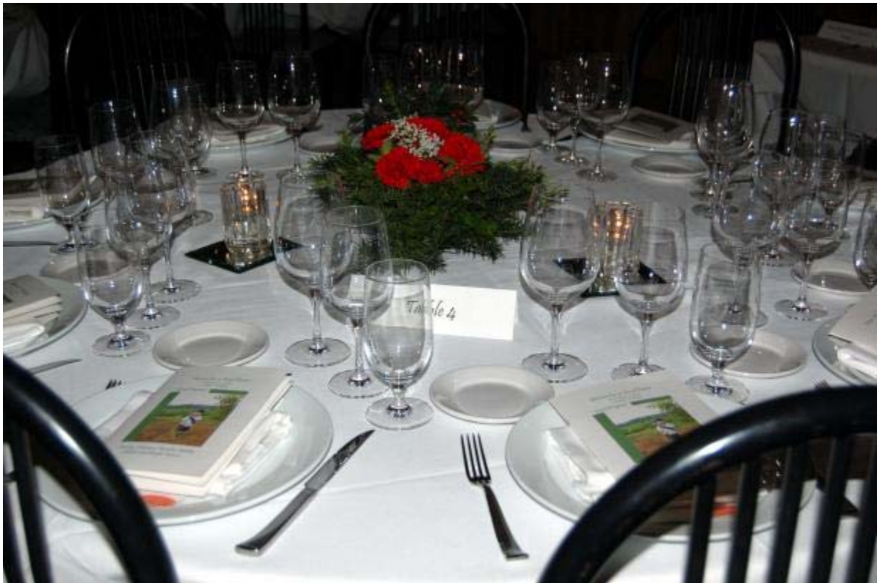
Beautifully set tables awaited guests who enjoyed elegant farm-to-table meals.