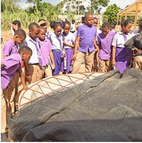
Curious students in the Alston District of Clarendon peer into the fish tank that feeds grow beds in their new community aquaponics system.