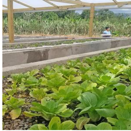
Newly trained aquaponics farmers in Clarendon tend their systems throughout the COVID-19 pandemic.

While the coronavirus pandemic has heightened awareness of the need for local food production, five communities in Clarendon, Jamaica are watching their food security strengthen by the day. In a recent article on INMED's community-based aquaponics project with the Ministry of Economic Growth and Job Creation and IDB Lab, farmers expressed great hope for the future of the new adaptive agriculture technique INMED Caribbean introduced over the past year.