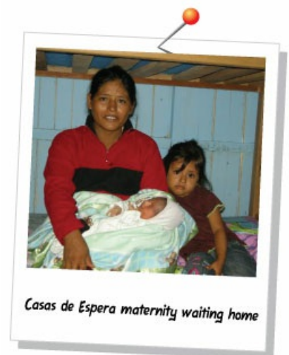
Casas de Espera maternity waiting home

Thanks to you , at-risk kids in South America are increasing their self-esteem while learning to play musical instruments in INMED's music program and building team skills in INMED's youth sports program, enriching their lives in ways their economic circumstances would not have otherwise allowed.